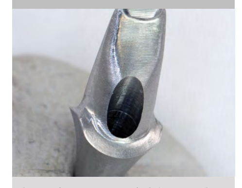
Razor-thin margins, sub 1.0 micron Ra subgingiva surface smoothness, smooth transition to interface, & more.