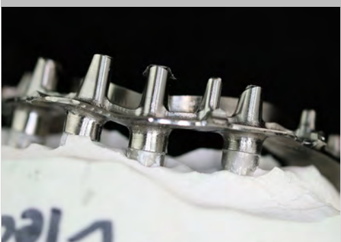
Produce all-on dental bars with no restriction to number of units and angulation with perfect fits.