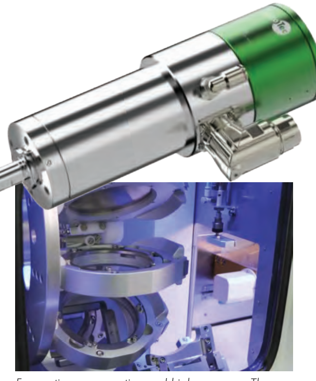
For continuous operation and high accuracy, The Versamill 5X500L features a 20-station automatic cartridge changer with zero-point fixturing.